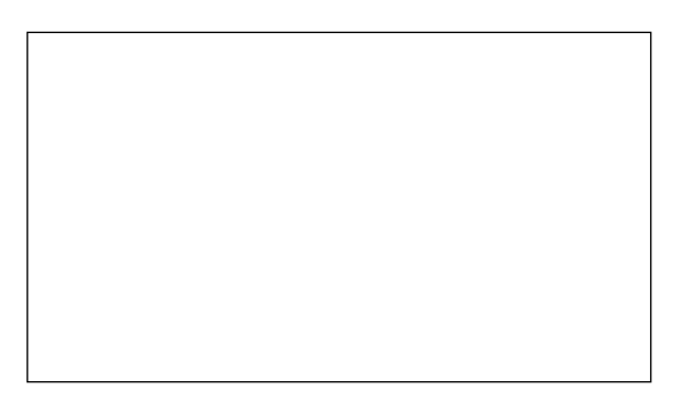
Figure 1 Figure caption

If figures are inserted into the main text, type figure captions below the figure. In addition, submit each figure individually as a separate file. Figures should be provided in a file format and resolution suitable for reproduction, e.g., EPS, JPEG or TIFF formats, without retouching. Photographs, charts and diagrams should be referred to as "Figure(s)" and should be numbered consecutively in the order to which they are referred