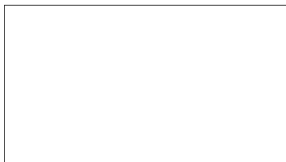
Figure 1 Figure caption

If figures are inserted into the main text, type figure captions below the figure. In addition, submit each figure individually as a separate file. Figures should be provided in a file format and resolution suitable for reproduction, e.g., EPS, JPEG or TIFF formats, without retouching. Photographs, charts and diagrams should be referred to as "Figure(s)" and should be numbered consecutively in the order to which they are referred